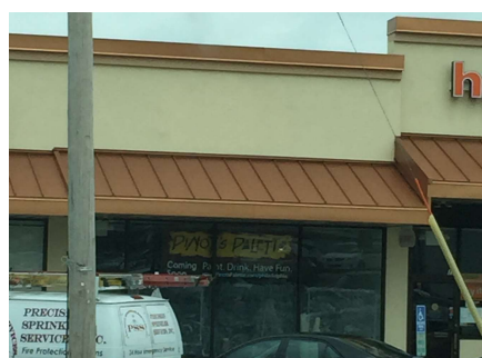
Pinot's Palette Before