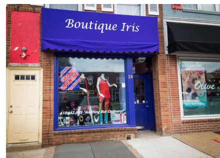
Boutique Iris After