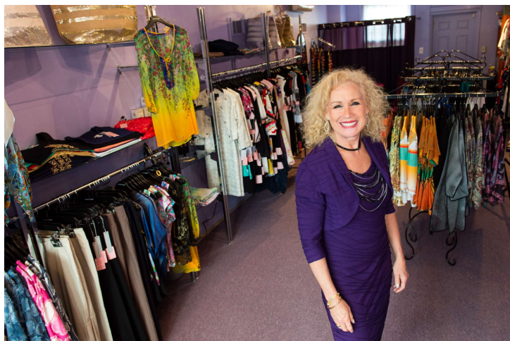
Boutique Iris