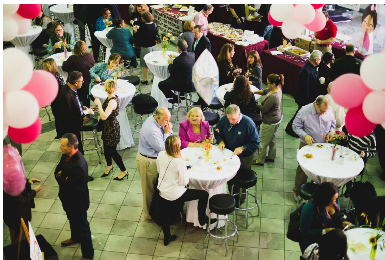
Taste of Ardmore

"The Ardmore business community is wonderfully vibrant and supportive. I couldn't have chosen a better location for my "paint and sip" studio, Pinot's Palette! The Ardmore Initiative provided valuable guidance and support before I even opened my doors - pointing me to resources that would help with my initial hiring and advertising and making me aware of the facade grant opportunity available to Ardmore merchants. Now that my business is thriving, I'm thrilled to be a contributing member of our community - giving back to the many, ongoing community-building events and activities. Ardmore is a shining example of small-town America. We are a diverse, engaged, connected community that eats, drinks, socializes, learns, and plays together!"