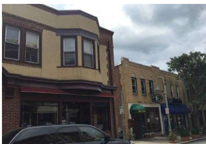
11 Cricket Ave. Before