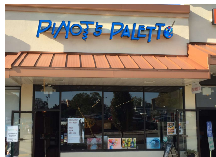
Pinot's Palette After