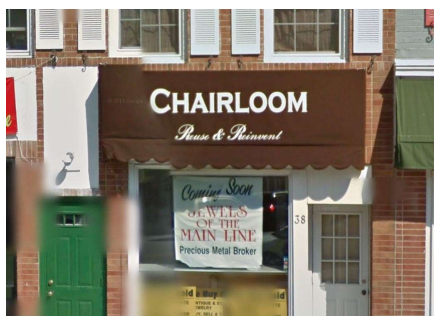
Boutique Iris Before