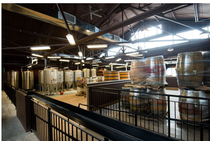
Tired Hands Fermentaria

"Ardmore was always a destination on our radar for our restaurants at FUEL. The close knit and involved community made it a perfect fit with our community standards at FUEL. The area and neighbors were so welcoming, becoming great repeat customers and friends. The Ardmore Initiative made the process of opening in a new area so simple with their helpful constant information. They answered all our concerns and were a critical part in helping us open ahead of schedule."