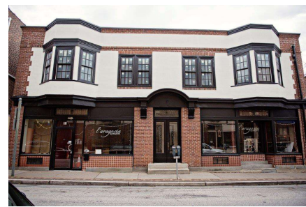
11 Cricket Ave. After